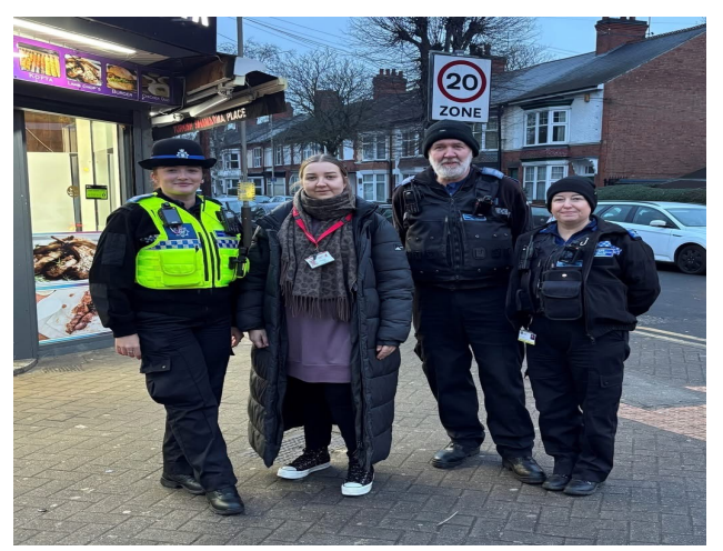
If you have a spare second, can you please consider filling out these two surveys;