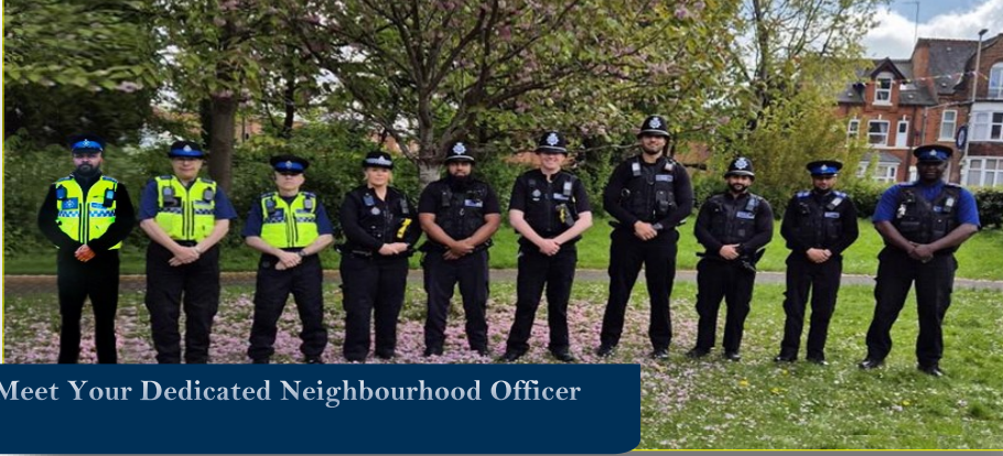
Meet Your Dedicated Neighbourhood Officer