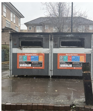
Investigating a series of deliberate fires on Kashmir Road, St Matthews.

A couple of pictures of some of the things we have been up to in January (Its been a cold one!)