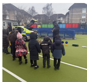
Engaging with the children at Taylor Road School about the police car and what we do.