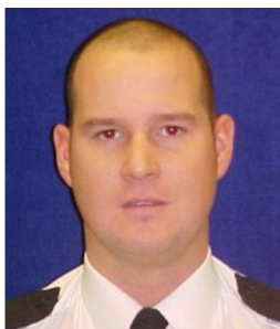
PS 1341 LEELAND