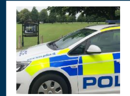
And more anti-social behaviour..