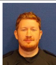
PC 892 Bond