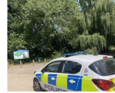
And even more anti-social behaviour