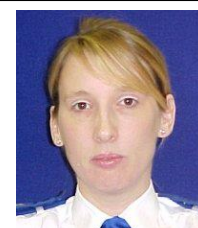
PCSO 6666 Eastwood