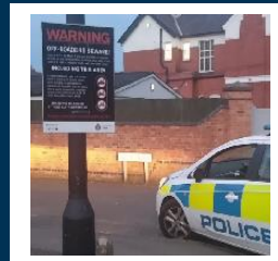
Targeting Anti-social behaviour..