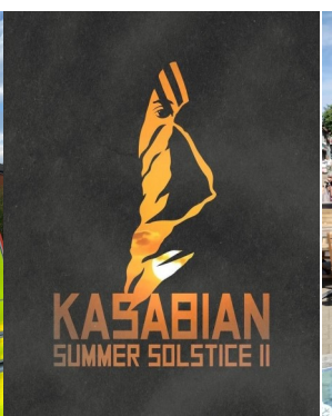
Summer solstice event in Victoria park, ensuring safety for all attendees