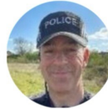
PC 1651 Stowell