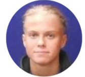
PCSO 6024 Proud

We have listened to you and the concerns you raised and will prioritise the following,