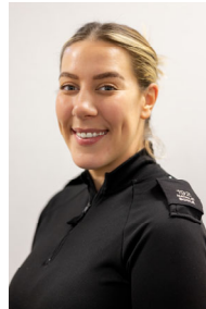
PC 192 Bogle