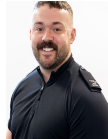
PC 4320 Bowen