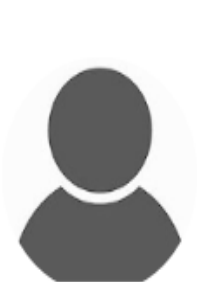
PS 820 Crowson